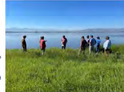
WATER POLICY INTERIM COMMITTEE MEMBERS AT LAKE HELENA.

As of June 23, 2022, the committee had not made a recommendation related to SJ 28.