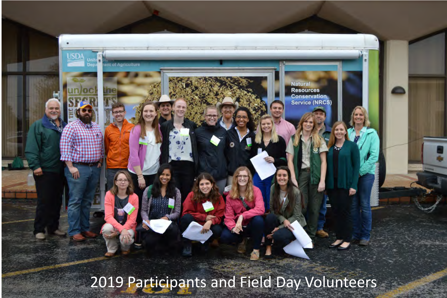
2019 Participants and Field Day Volunteers

The Conservation Careers Workshop is unique in that a small group of students are provided the opportunity to build a personal relationship with professionals. Workshop participants will meet possible mentors during presentations and will have field experiences, as well as receptions and meals to network and gain insights into potential career opportunities. 2019 was the first year for this expanded format and had increased USDA: NRCS support for 10 participants.