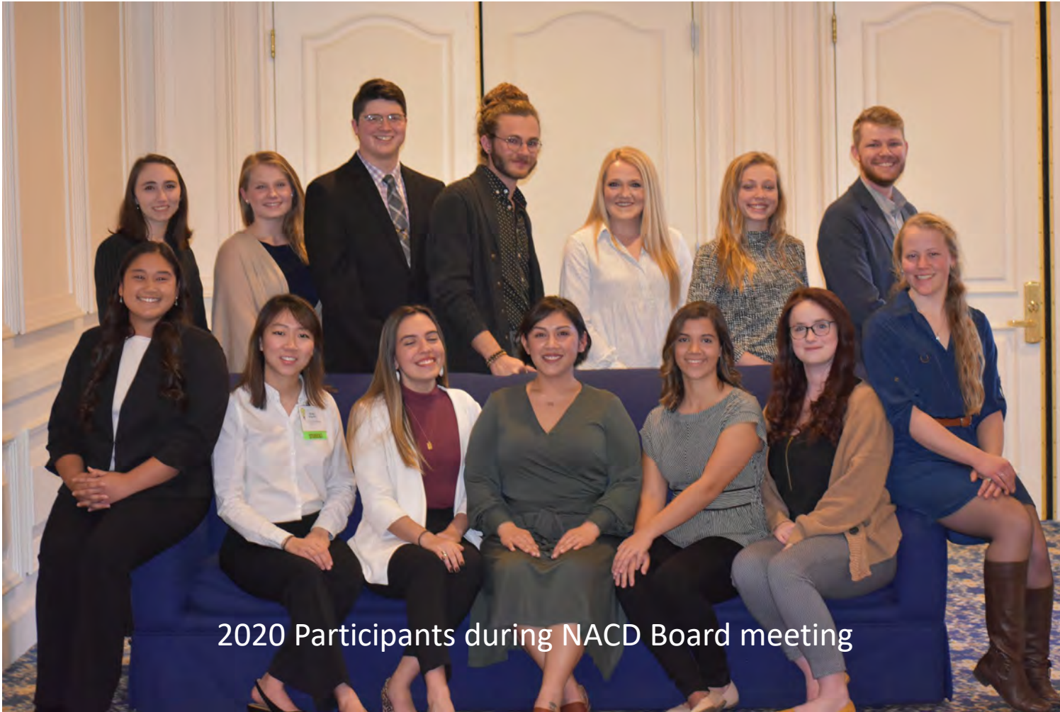
2020 Participants during NACD Board meeting

In 2020 the workshop provided an immersive experience for up to 15 highly qualified undergraduate college students and showcased career paths in conservation, agriculture and natural resources management. Attendees learned about career options within the National Conservation Partnership, met conservation professionals and made valuable contacts. The National Conservation Partnership includes the USDA, NRCS, USFS, state conservation agencies and conservation districts from across the United States. Continued funding through the USDA: NRCS and additional funding from the US Forest Service expanded the number of participants to 15.