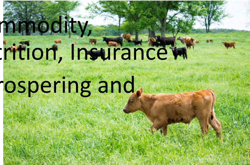
Natural Resources Conservation Service