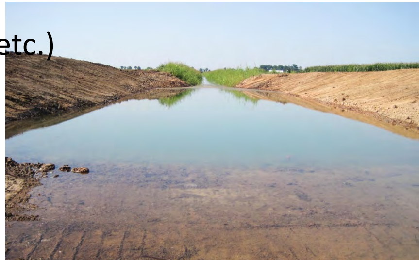
Natural Resources Conservation Service

Soil Water Air Plants Animals People Soil Water Air Plants Animals Helping People Help the Land