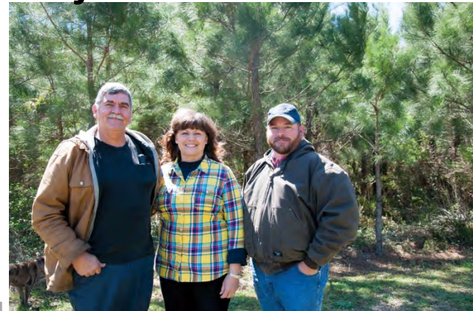
Natural Resources Conservation Service

Soil Water Air Plants Animals People Soil Water Air Plants Animals Helping People Help the Land