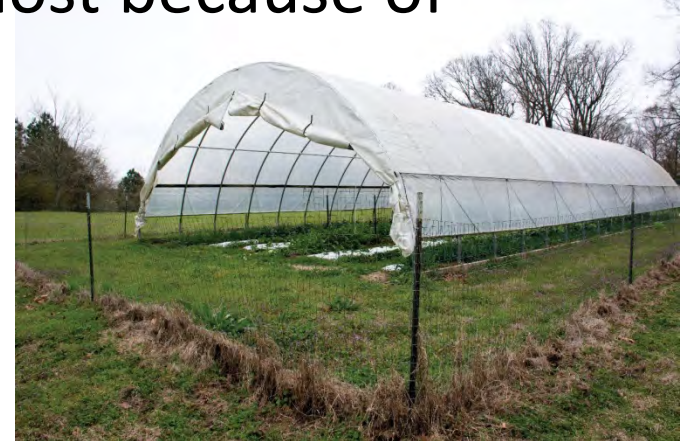
Natural Resources Conservation Service

Soil Water Air Plants Animals People Soil Water Air Plants Animals Helping People Help the Land