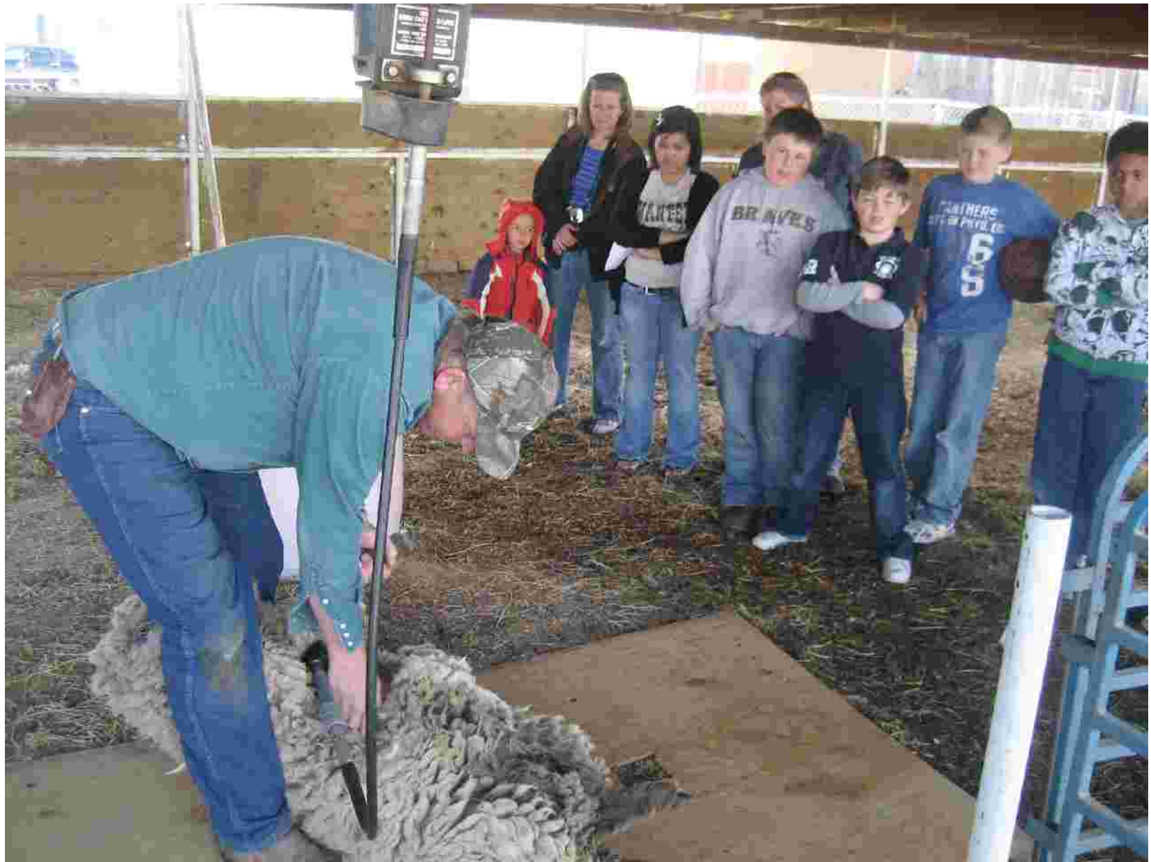
Summit County Conservation District Farm Field Day