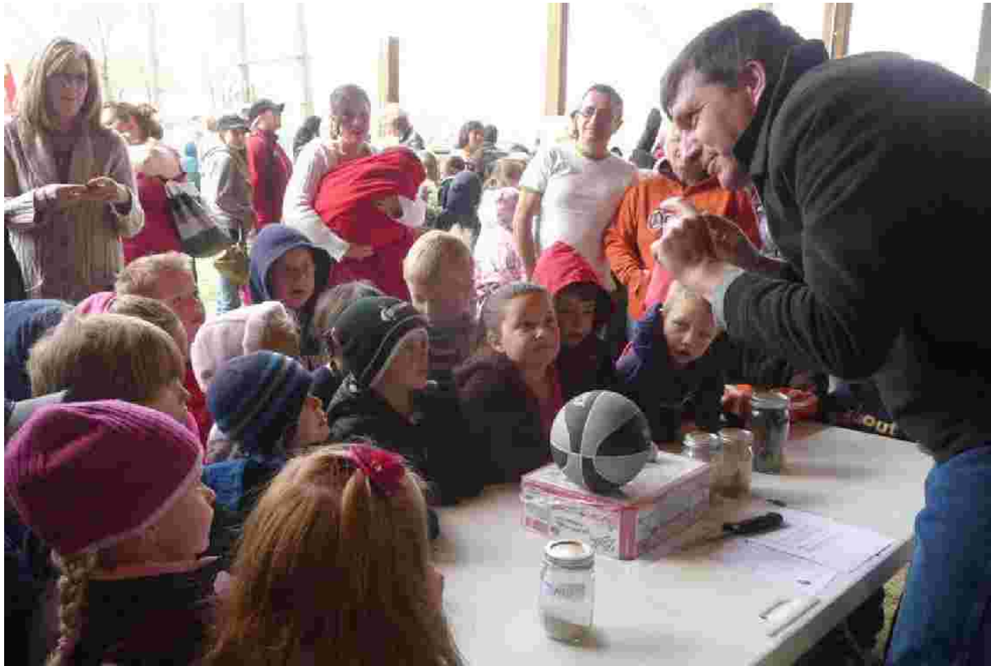
Salt Lake Conservation District Farm Field Day