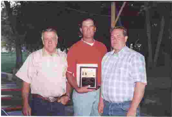
Sevier County CD