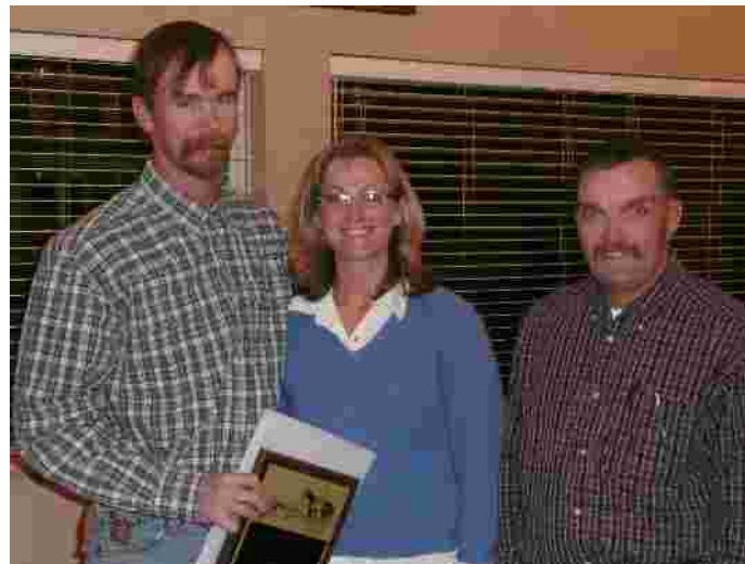
Fremont River CD

Some districts give a Conservation Farmer of the Year awards each year.