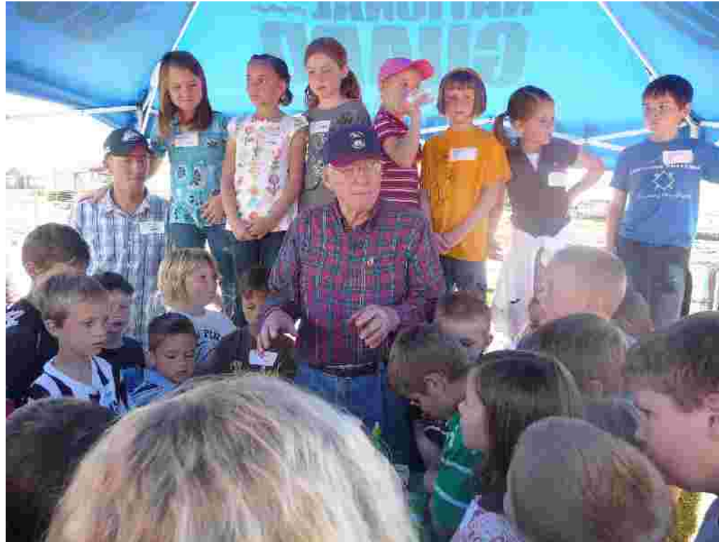
Davis Conservation District Farm Field Day