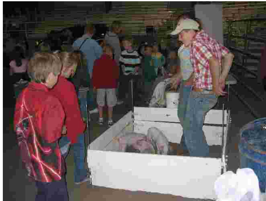
Zone 5 Farm Field Day

Conservation Districts helps sponsor Farm Field Days every spring. Elementary students spend a day on the farm learning in a hands-on environment.