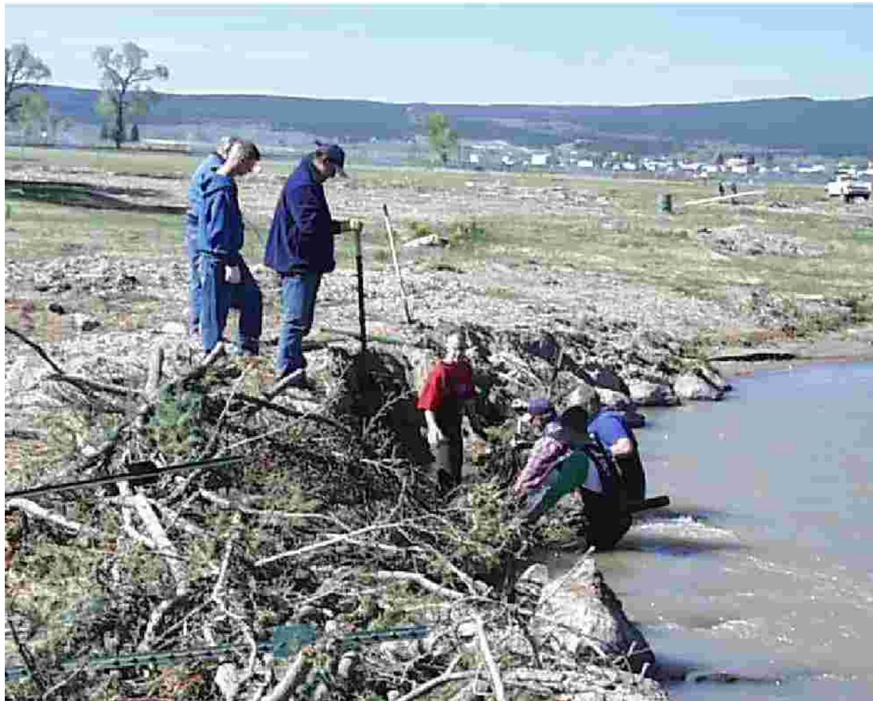
Upper Sevier Conservation District Watershed Project.

But we don't stop at children and teenagers. Grown ups also can have hands on opportunities.