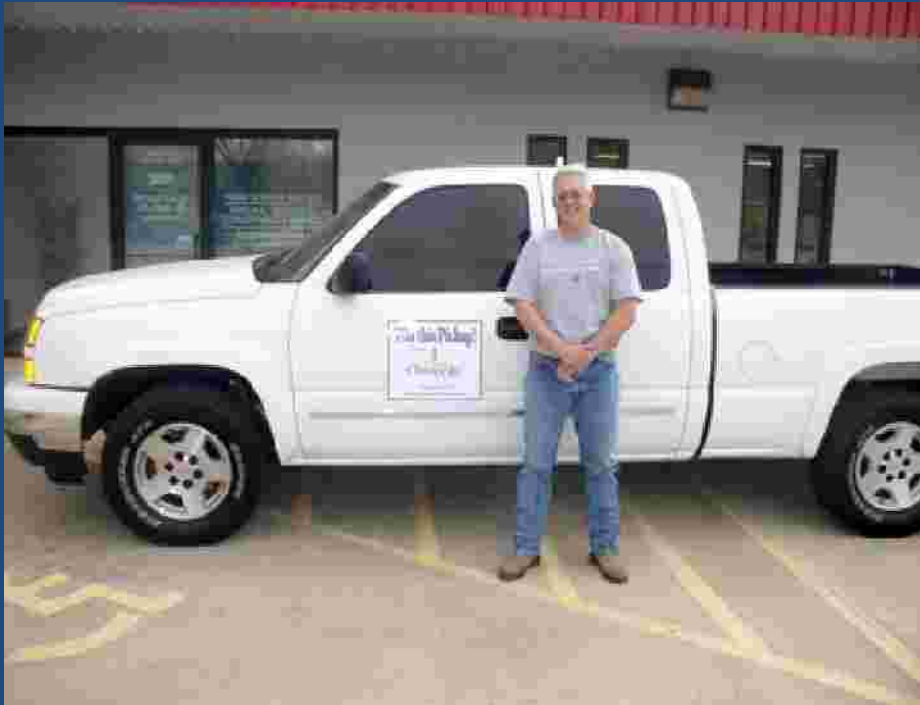
Pickup Raffle at State Meeting