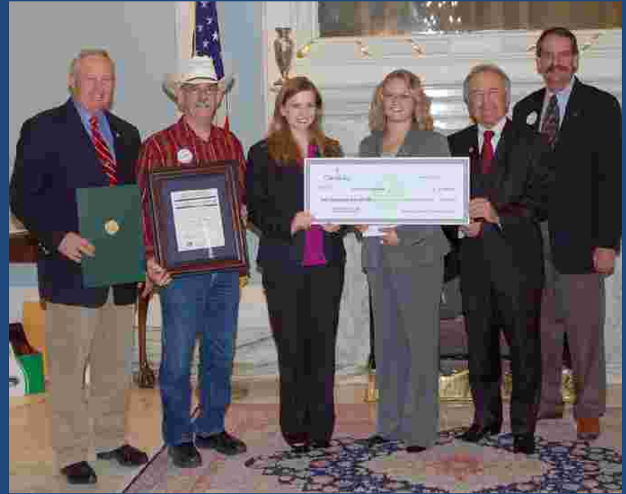
Teacher of the Year Awards